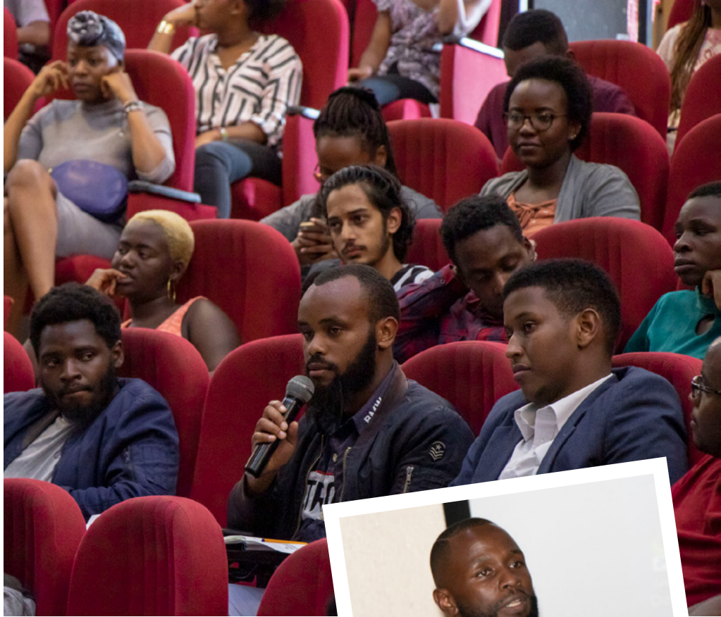
A journalism major asks a question during the Q & A session of the Journalism Alumni Mentorship Forum held on Wednesday, February 27 in the auditorium.