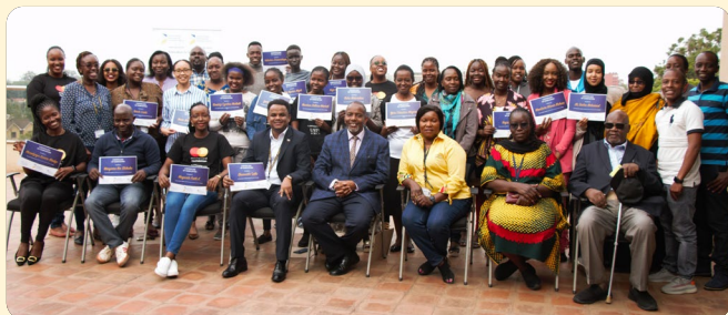
The graduating cohort included several members of staff and faculty who studied various courses including Kenya Sign Language (KSL), Swahili, English Writing Intensive, Spanish, Chinese, and French.