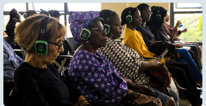
Participants listen to the audio film during the event.