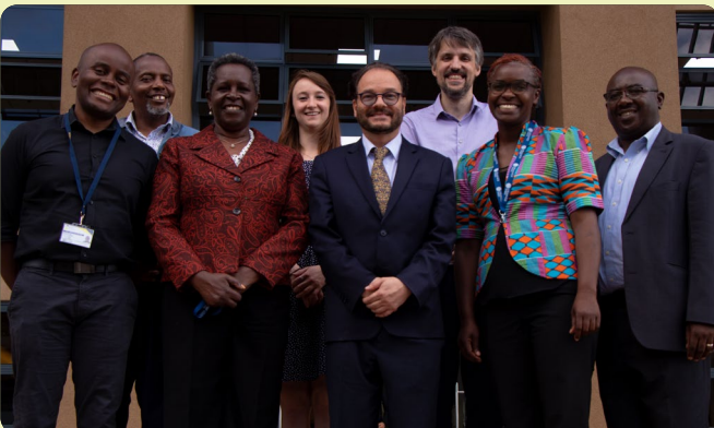
The presenters (centre) pose with faculty from the Department of Psychology.